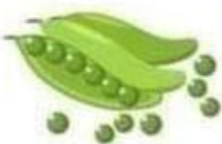
petit pois pea