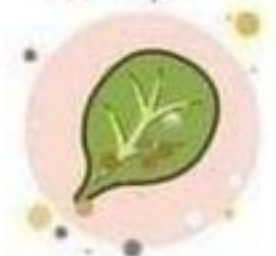
les épinards spinach