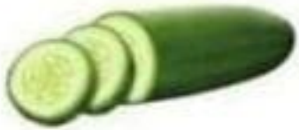
le concombre cucumber