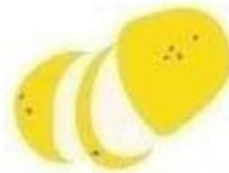
la pomme de terre potato