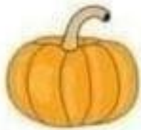
la citrouille pumpkin