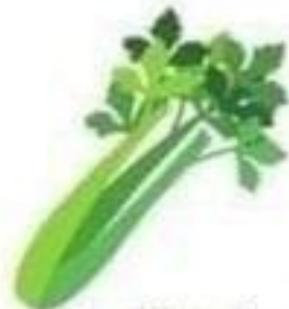
le céleri celery