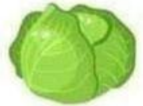
le chou cabbage