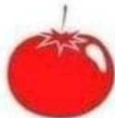
la tomate tomato