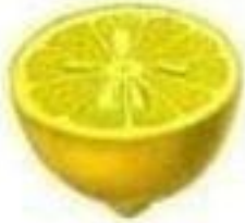
le citron lemon