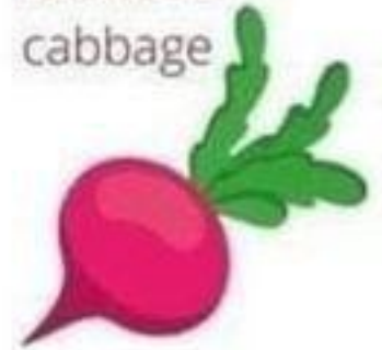
le navet turnip