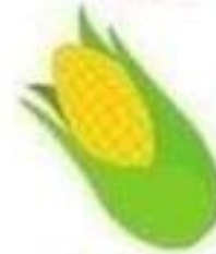
le maïs corn