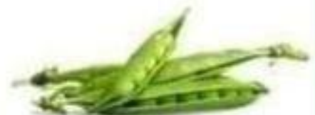
les haricots haricot bean