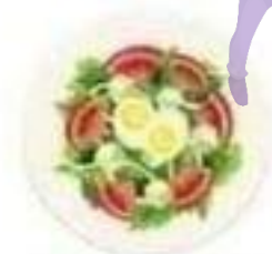
la salade salad