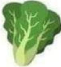
la laitue lettuce