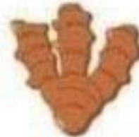
le gingembre ginger