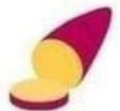
La patate douce yam