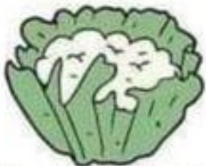
le chou-fleur cauliflower