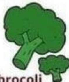
le brocoli broccoli