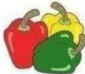
le poivron bell pepper