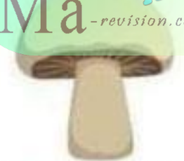
le champignon mushroom