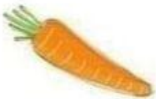
la carotte carrot