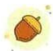
la châtaigne chestnut