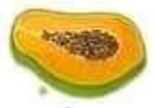
la papaye papaya