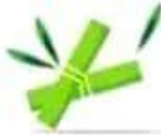
le bamboo bambou