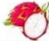
fruit du dragon Dragon fruit