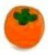
le kaki persimmon