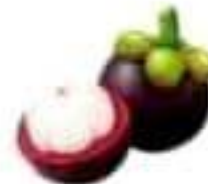
le mangoustan mangosteen