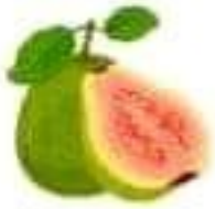
la goyave guava