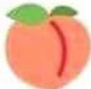
la pêche peach