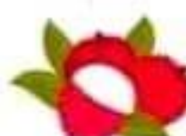
le litchi lychee