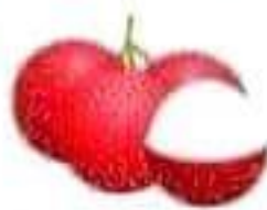
le ramboutan rambutan