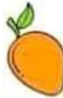
la mangue mango