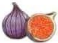
la figue fig