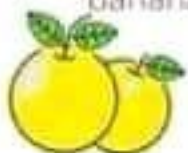
la mandarine mandarin orange