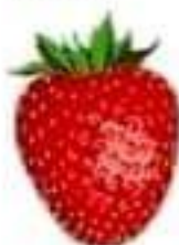
la fraise strawberry