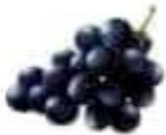
le raisin grapes