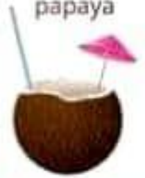
la noix de coco the coconut