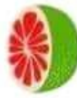
le pamplemousse grapefruit