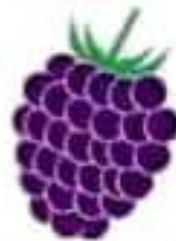
la framboise raspberry