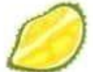
le durian durian