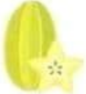
la carambole starfruit