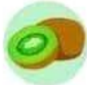
le kiwi kiwi