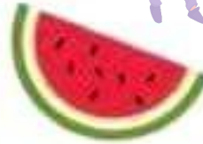
la pastèque watermelon