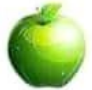
la pomme apple