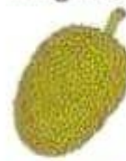
le jacquier jackfruit